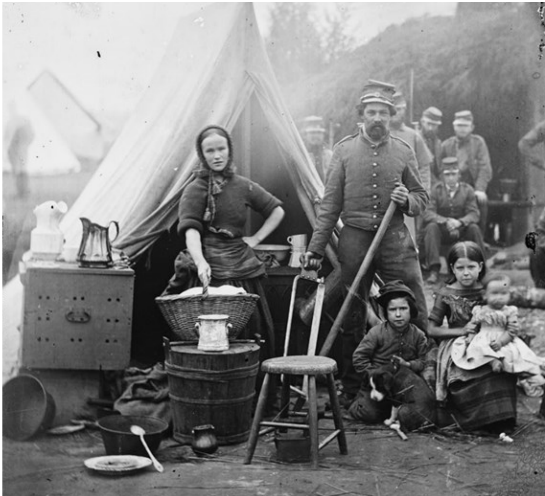
Laundress and her family at Fort Slocum