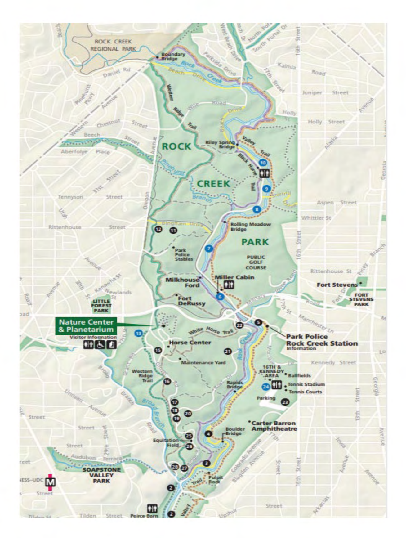
Figure 1. Project action area in Rock Creek Park is highlighted in yellow.