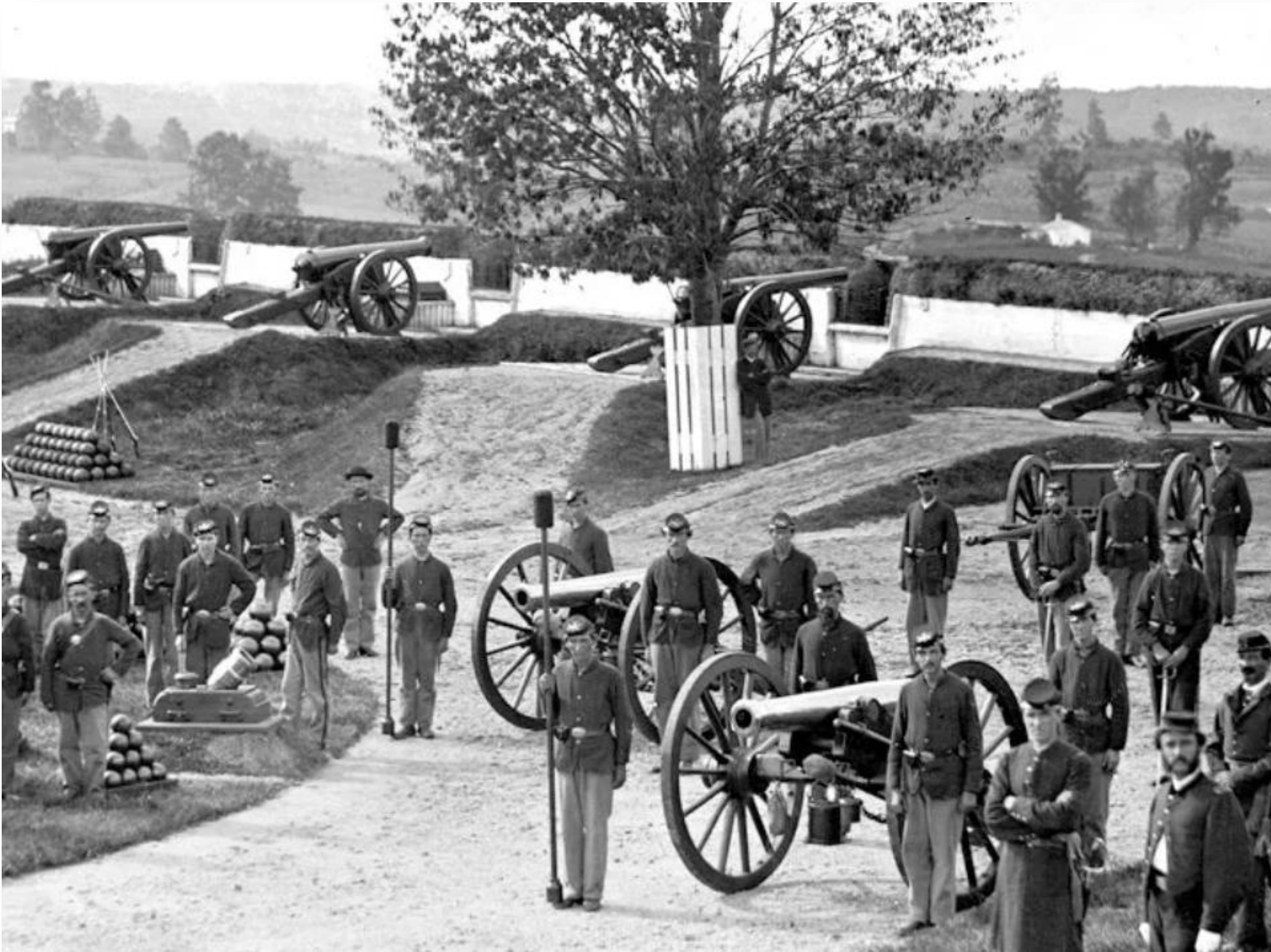
Company F, 3rd Regiment Massachusetts Heavy Artillery at Fort Stevens.