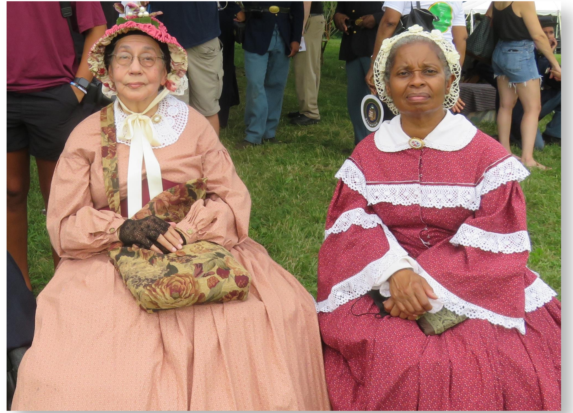
Female RE-Enactors of Distinction (FREED)