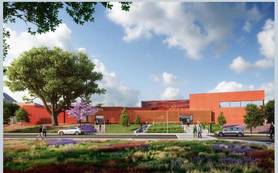
Artistic Rendering of the new Poolhouse and Recreation Center