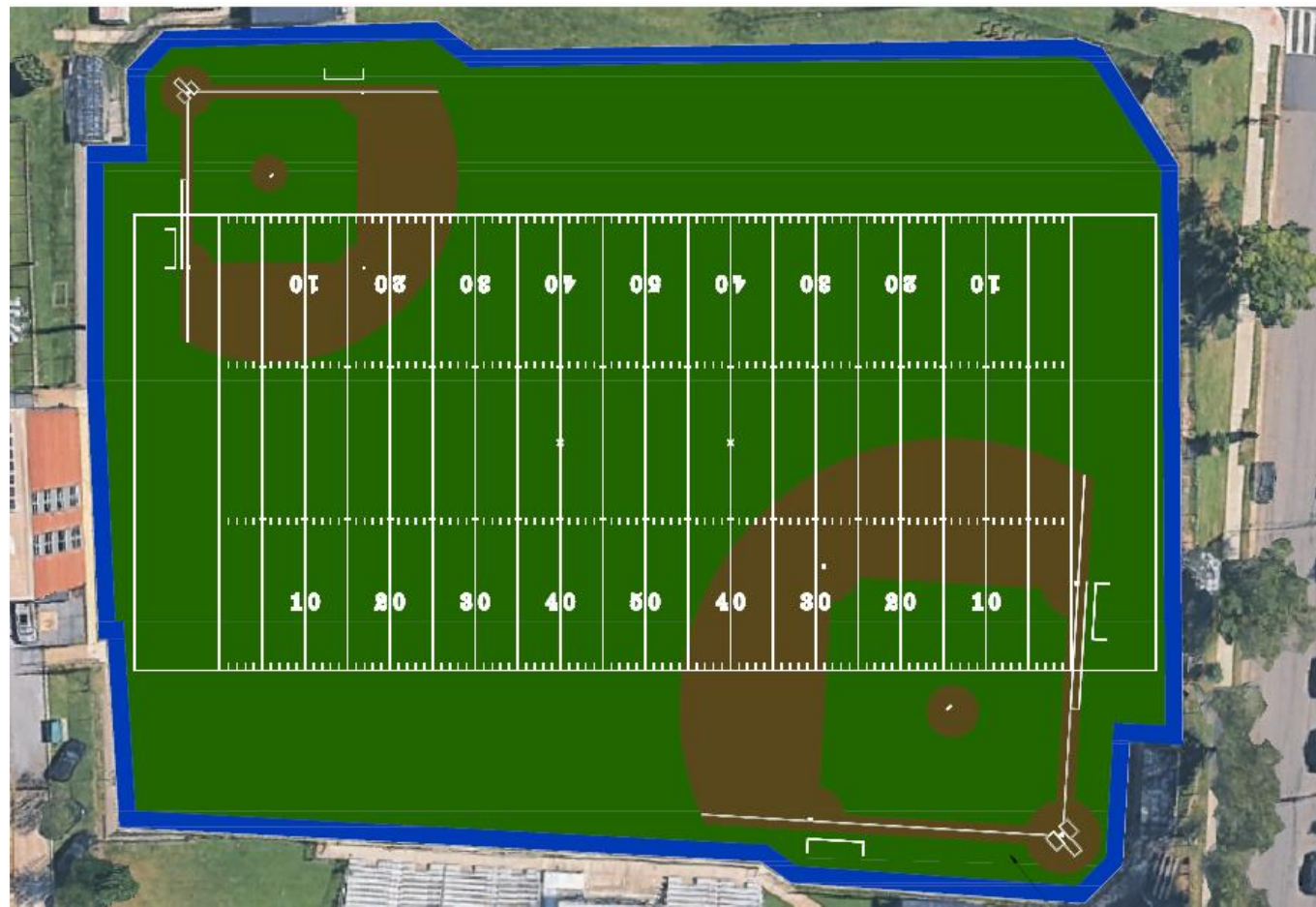
Conceptual Field Layout